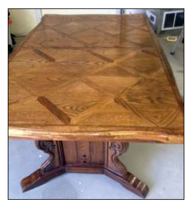
Dining Table - This family heirloom was severely weathered. It required a full sanding, stain and new finish to restore this oak table to a new life.