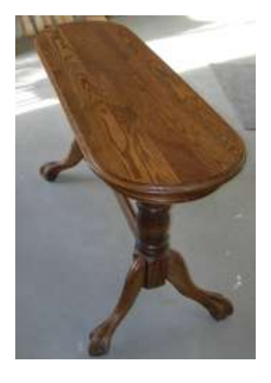
Sofa Table - The table had water damage to the top. I was able to refinish it and bring back to life.