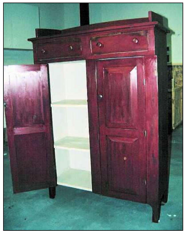
Dry Sink Cupboard