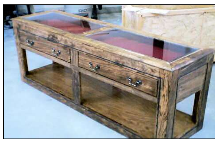
Knife Display Case