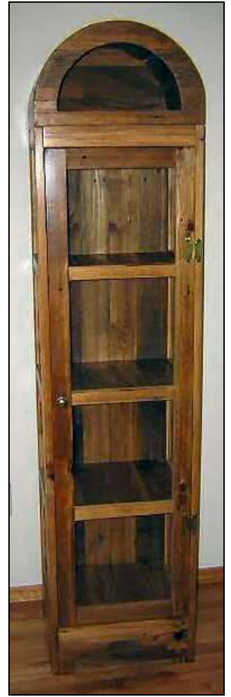
Cedar Curio Cabinet