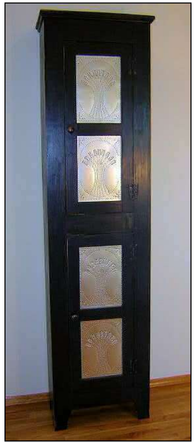
7 ft. Pie Safe