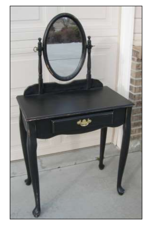
Old Black Vanity – After some sanding and repainting this old vanity was restored to a very nice antique look.

Vintage Dining Room Chairs – These five dining chairs had been severely damaged from being left out in the weather for years. After removing the finish, sanding, tightening all the spindles we reconstructed and reupholstered the seats to fully restore the chairs.