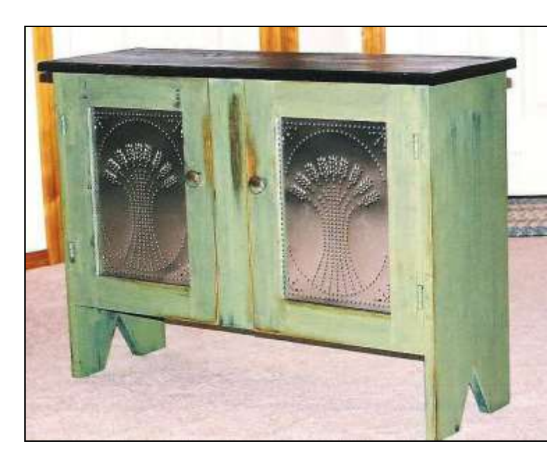
Horizontal Pie Safe