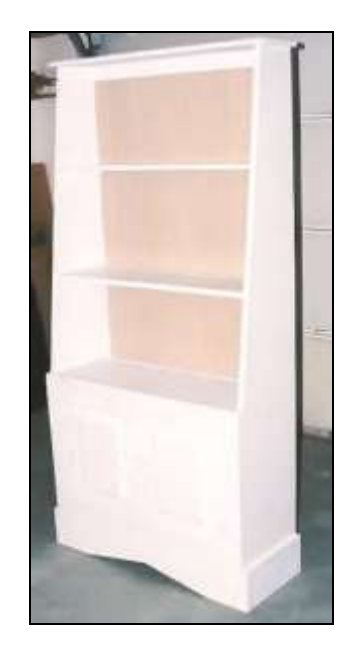
Cantback Kitchen Cupboard