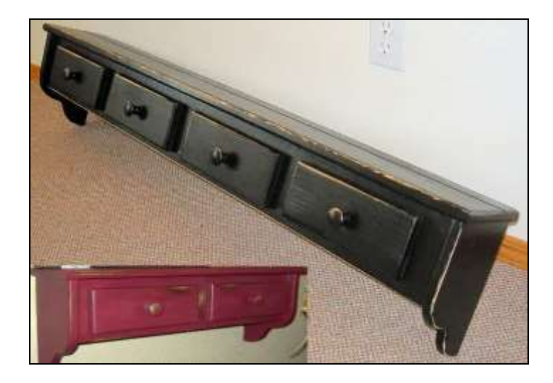
Wall Shelves with Drawers