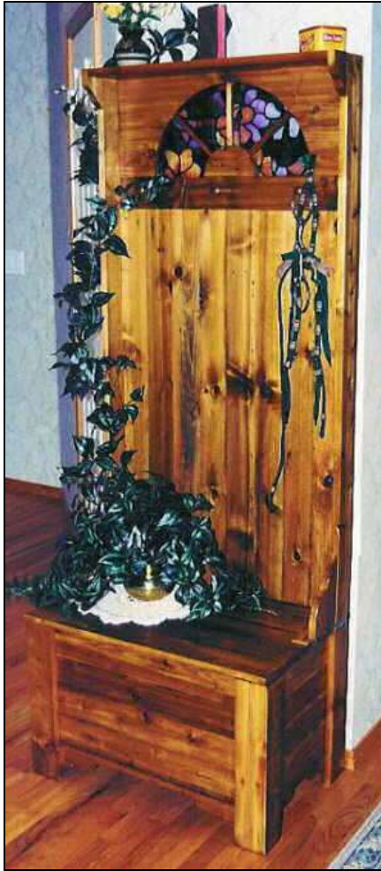
Cedar Hall Tree