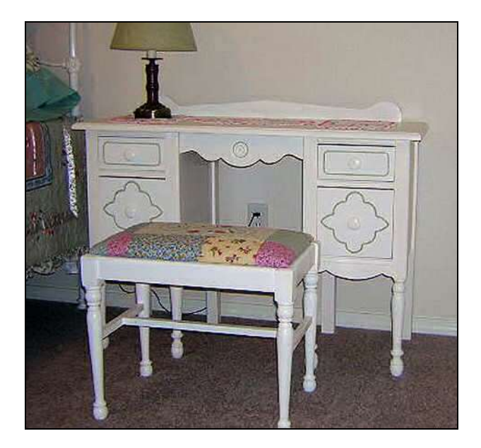
Antique Vanity Desk and Bench-This old vanity came in numerous pieces. It required rebuilding the drawers and bench, retightening the legs and refinishing and painting the entire piece to get it fully restored.