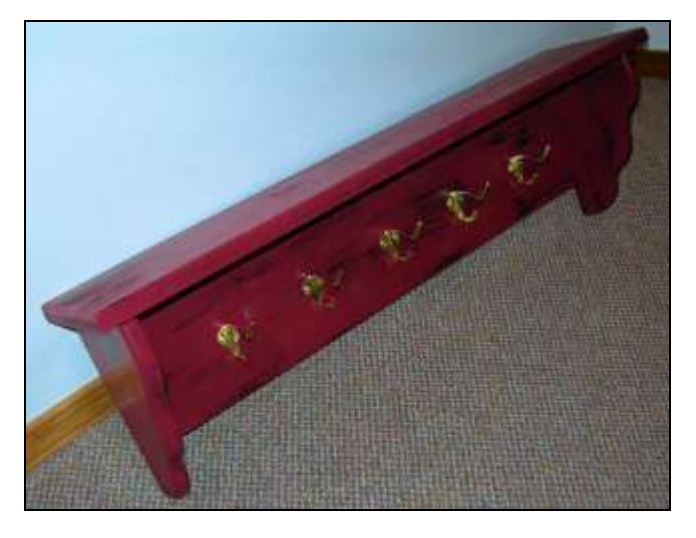
Wall Shelf with Coat Hooks