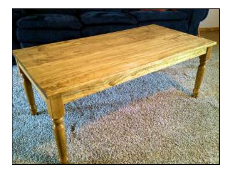
Coffee Table - The table top was warped from water damage. A new top and it was restored like new.