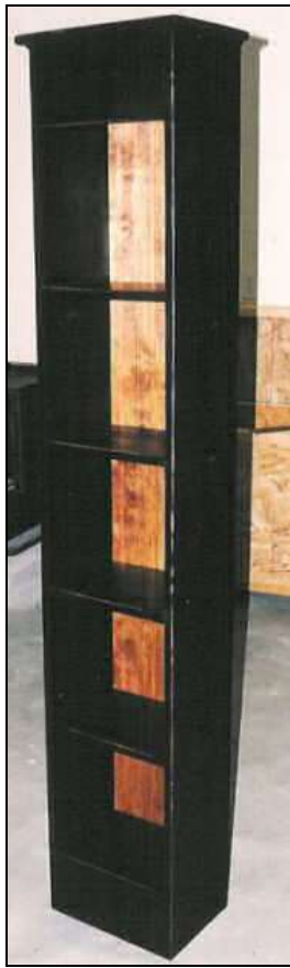
7 ft .Country Cupboard