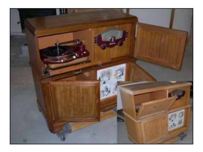
Vintage Stereo Cabinet – This 1947 stereo cabinet required lots of sanding, a new finish and new top to restore it to a brilliant new look.