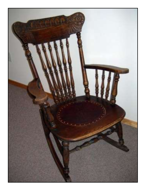
Antique Rocking Chair - This century old rocker required a new leather seat, full spindle tightening and a reconstructed rocker to get it fully restored.